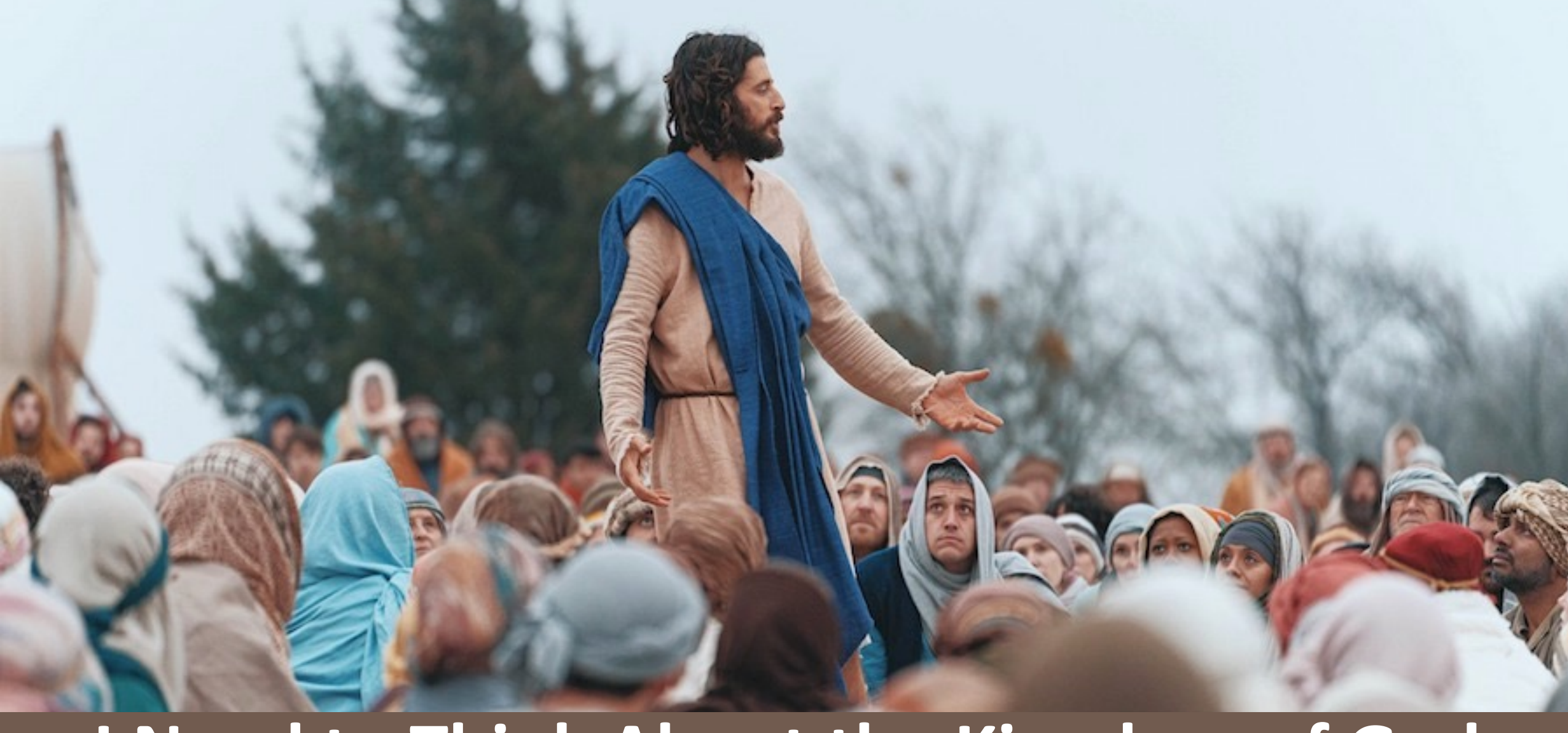
I Need to Think About the Kingdom of God