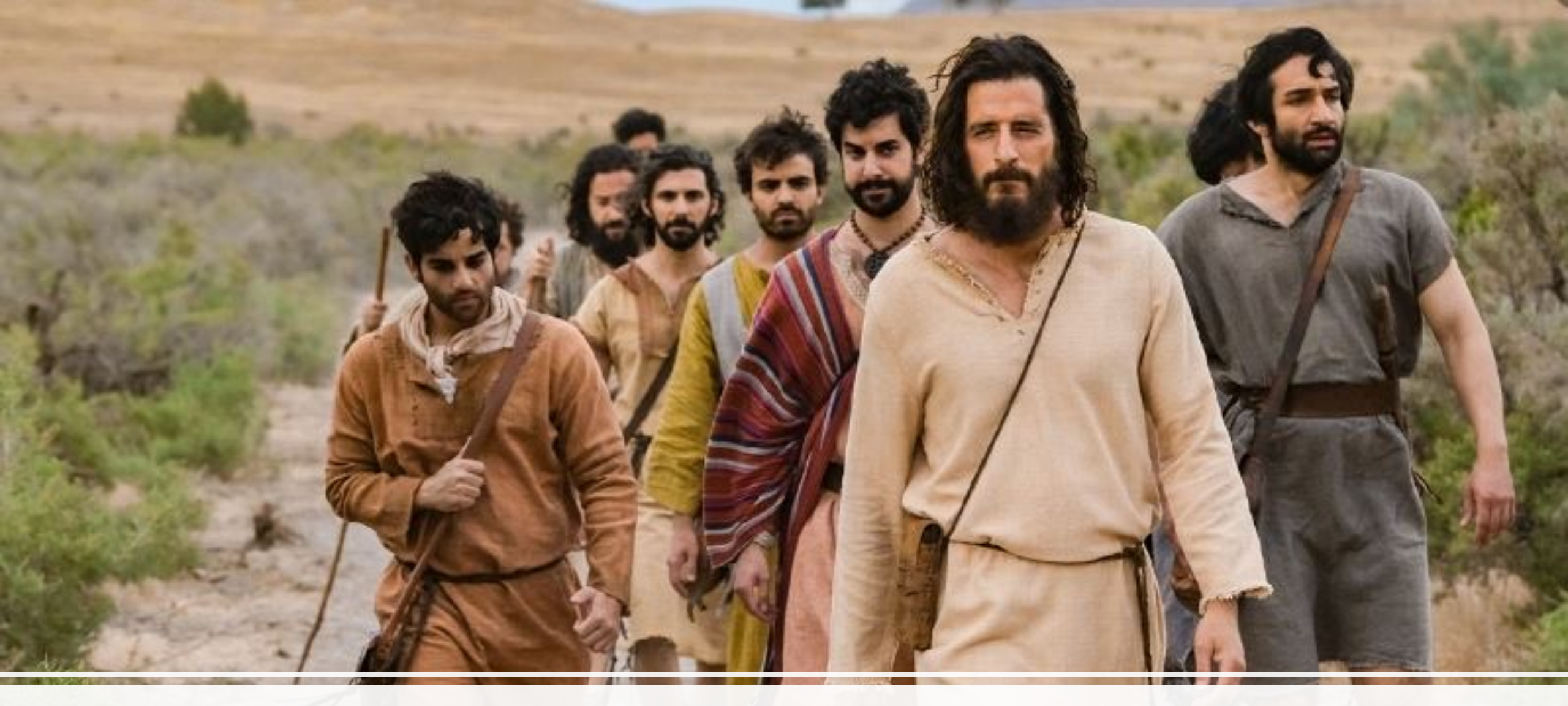
God has called each follower of Jesus to LIVE ON MISSION!