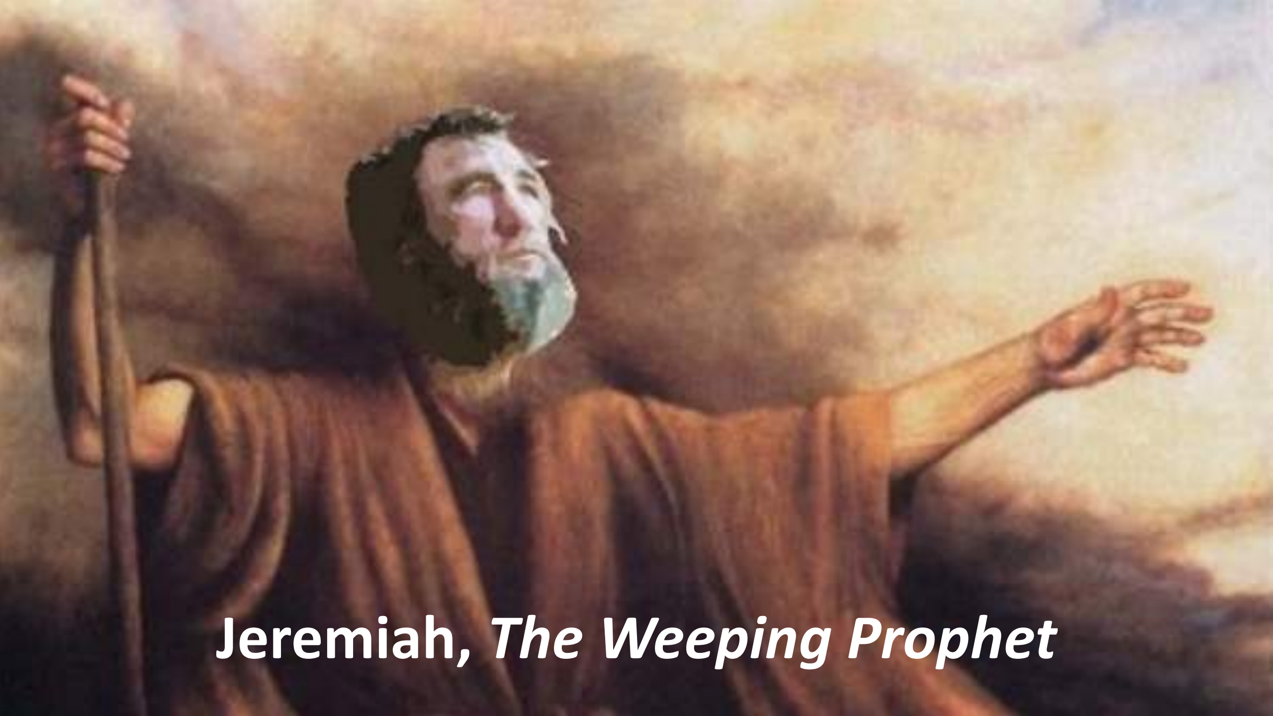
Jeremiah, The Weeping Prophet