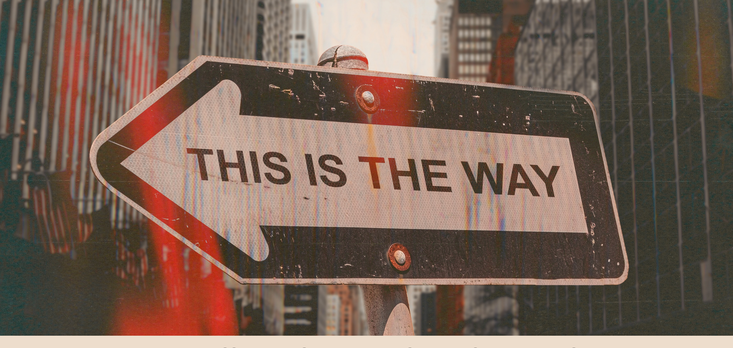
2. Be in Fellowship with Other Believers