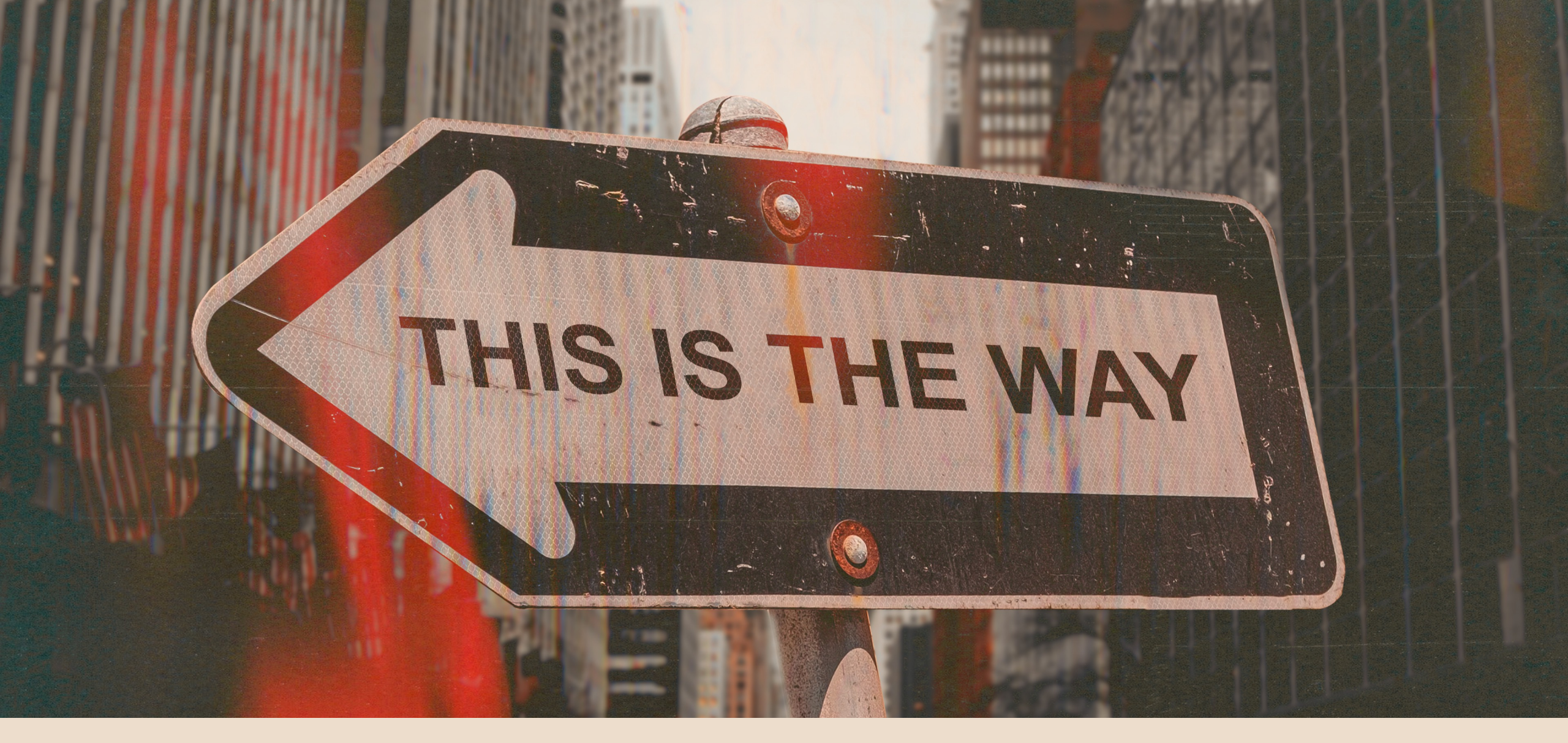
3. Pray to Know God and His Will