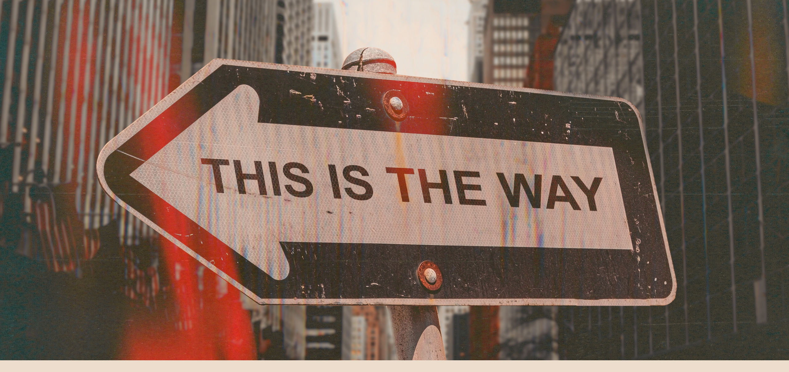
6. Fast to Know God's Will