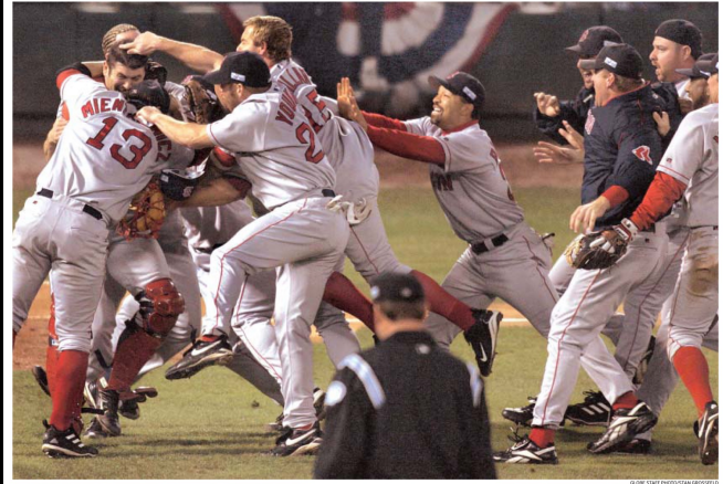
The Red Sox stormed the Busch Stadium field to celebrate their commanding march to the world championship. The Sox did not trail for a single inning of the four-game sweep of the Cardinals.