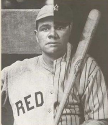
George Herman Ruth, Jr. - "Babe" Ruth Sold to Yankees by Sox Manager Frazee to Finance Broadway Play No No Nanette

The act of President Roosevelt's address to the Nation is a landmark event. It is a landmark event because it is the first time that a President has addressed the Nation in a public address. It is a landmark event because it is the first time that a President has addressed the Nation in a public address. It is a landmark event because it is the first time that a President has addressed the Nation in a public address.