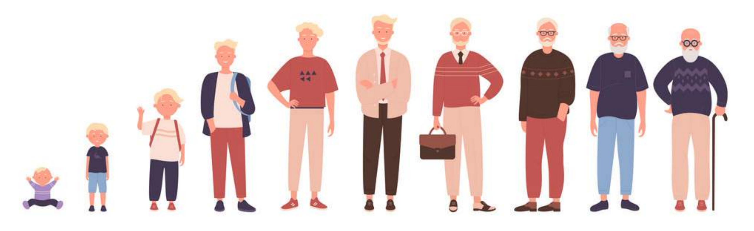
Our Whole Life Matters to God!