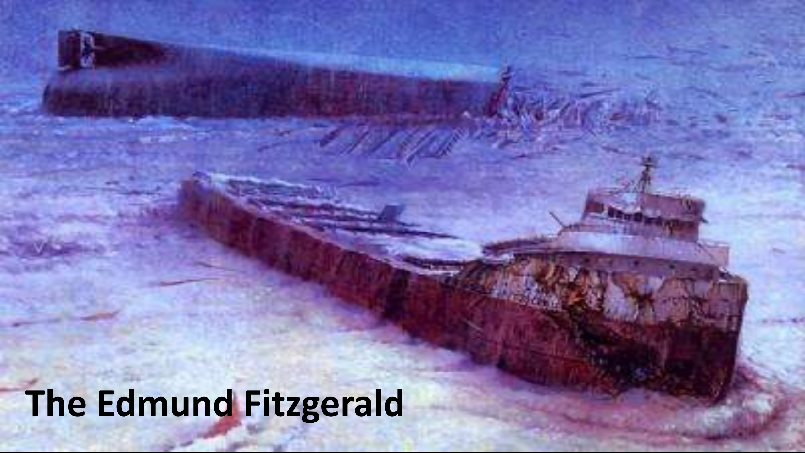
The Edmund Fitzgerald