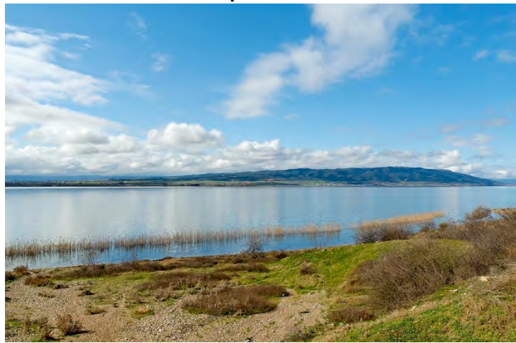
(Bolen, Apollonia from the north 2012, Used with Permission)

We have very little of Apollonia to look at since excavations only started there on 2000 and there is simply not much to see at present. But there is the lake. "Still, it remained a major trade and travel route, and Apollonia often became a stopping point along the way for travelers." (Peach 2016)