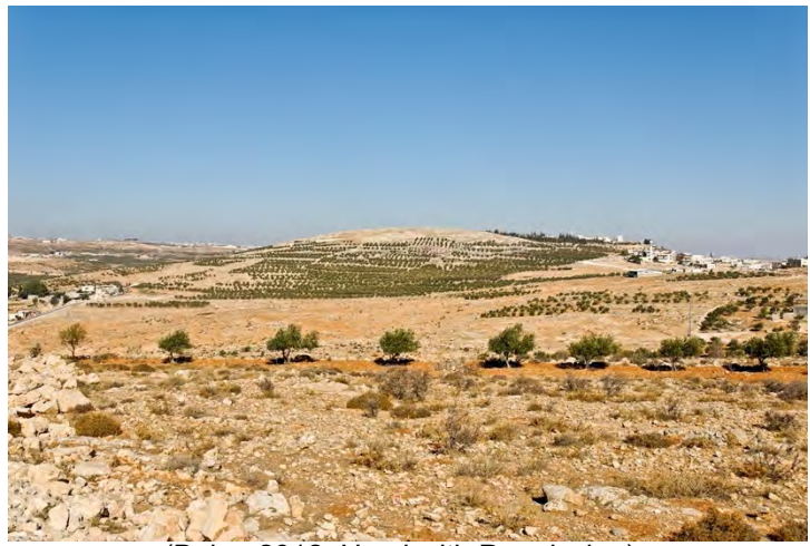
(Bolen 2012, Used with Permission)