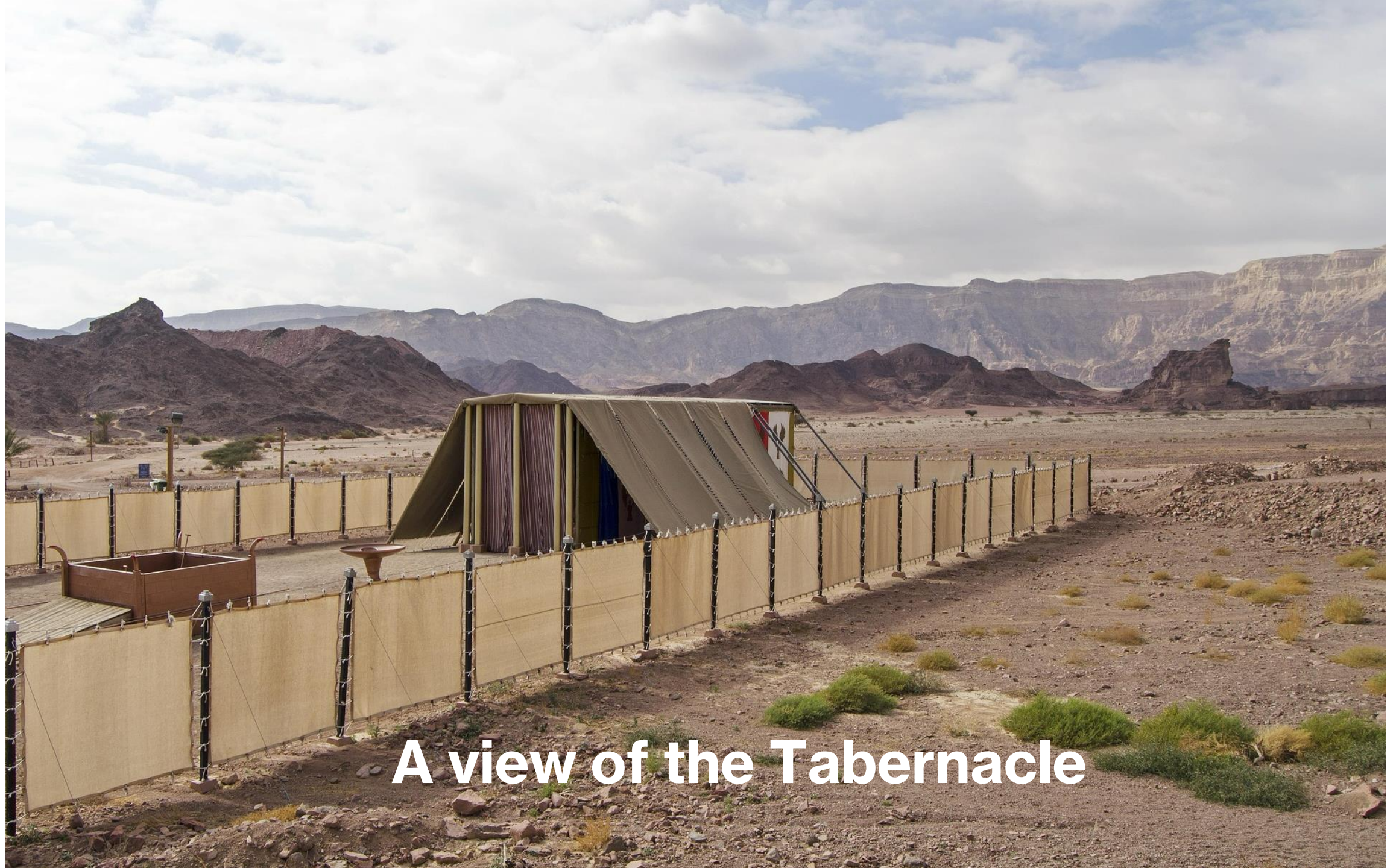
A view of the Tabernacle