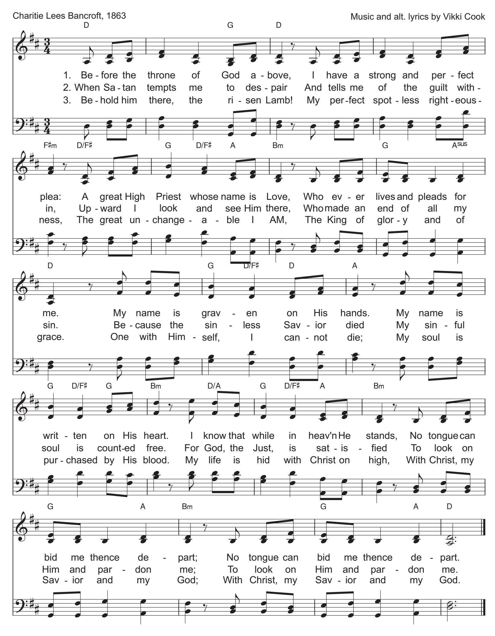
© 1997 Sovereign Grace Worship (ASCAP). Sovereign Grace Music, a division of Sovereign Grace Churches. All rights reserved. Administrated worldwide at www.CapitolCMGPublishing.com, excluding the UK which is adm. by Integrity Music, part of the David C Cook family. www.SovereignGraceMusic.org CCLI Song #2306412 | CCLI License #11604360