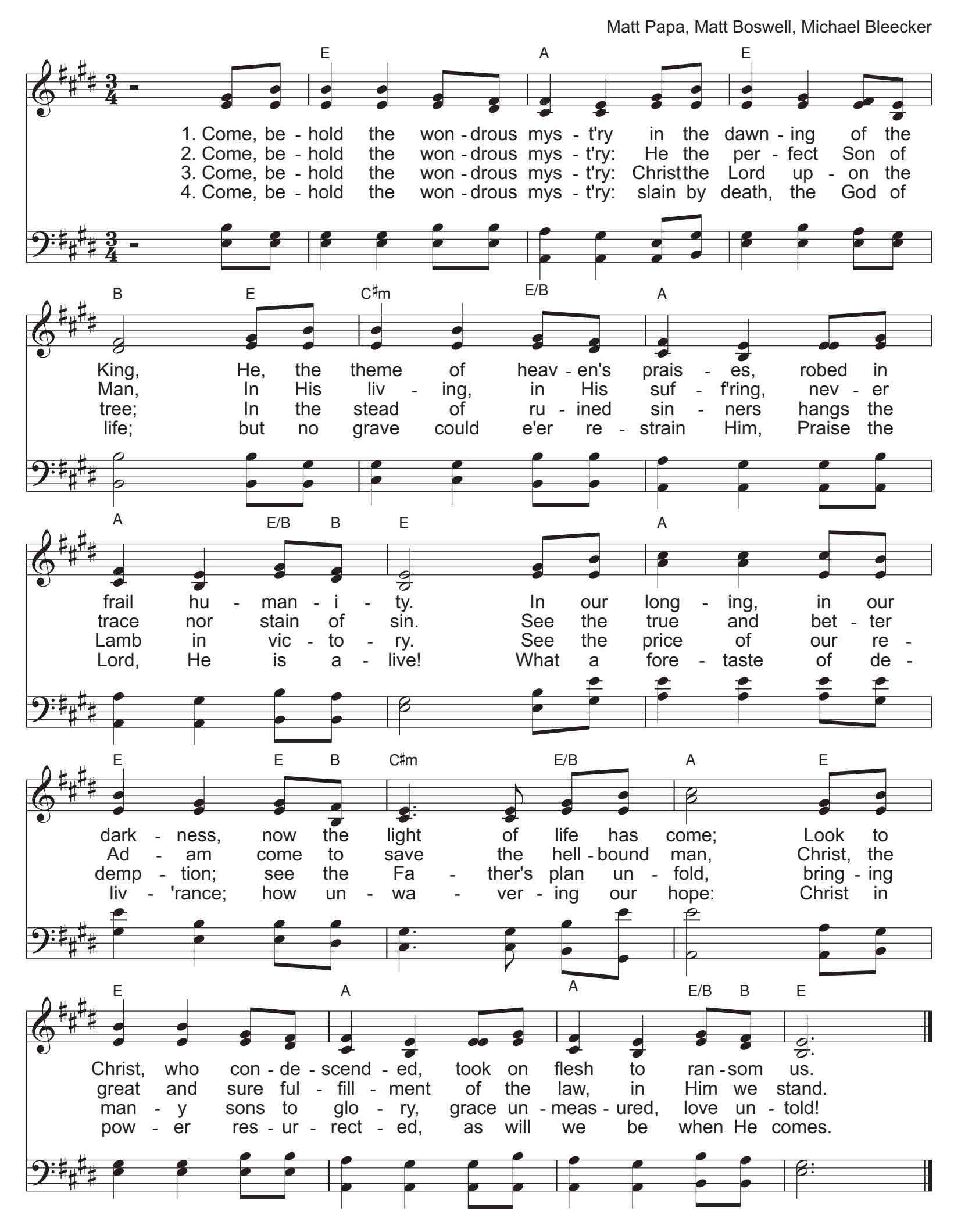
© 2013 Love Your Enemies Publishing, Getty Music Hymns and Songs, Getty Music Publishing, McKinney Music, Inc. Administered by MusicServices.org. All rights reserved. Used by Permission. CCLI Song #7036028 | CCLI License #11604360