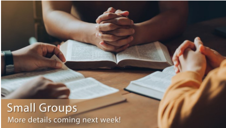
Small Groups More details coming next week!

TODAY is Fall Kickoff! Enjoy some specialty coffee and beverages from Biggby plus lots of tasty treats; located under the canopy!