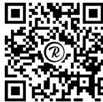
Online Giving QR Code

(Undesignated checks and loose offerings will be credited to the Church Family Budget)