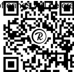
Online Giving QR Code

(Undesignated checks and loose offerings will be credited to the Church Family Budget)