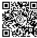
QR Code Online Giving