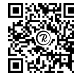
Online Giving QR Code

(Undesignated checks and loose offerings will be credited to the Church Family Budget)