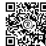
Online Giving QR Code

(Undesignated checks and loose offerings will be credited to the Church Family Budget)