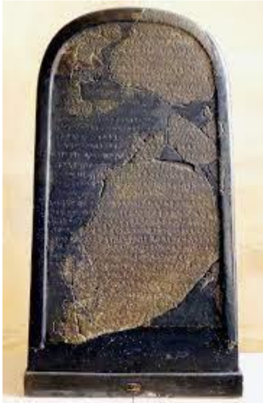
The Mesha Stele; The Louvre Museum, Paris, France