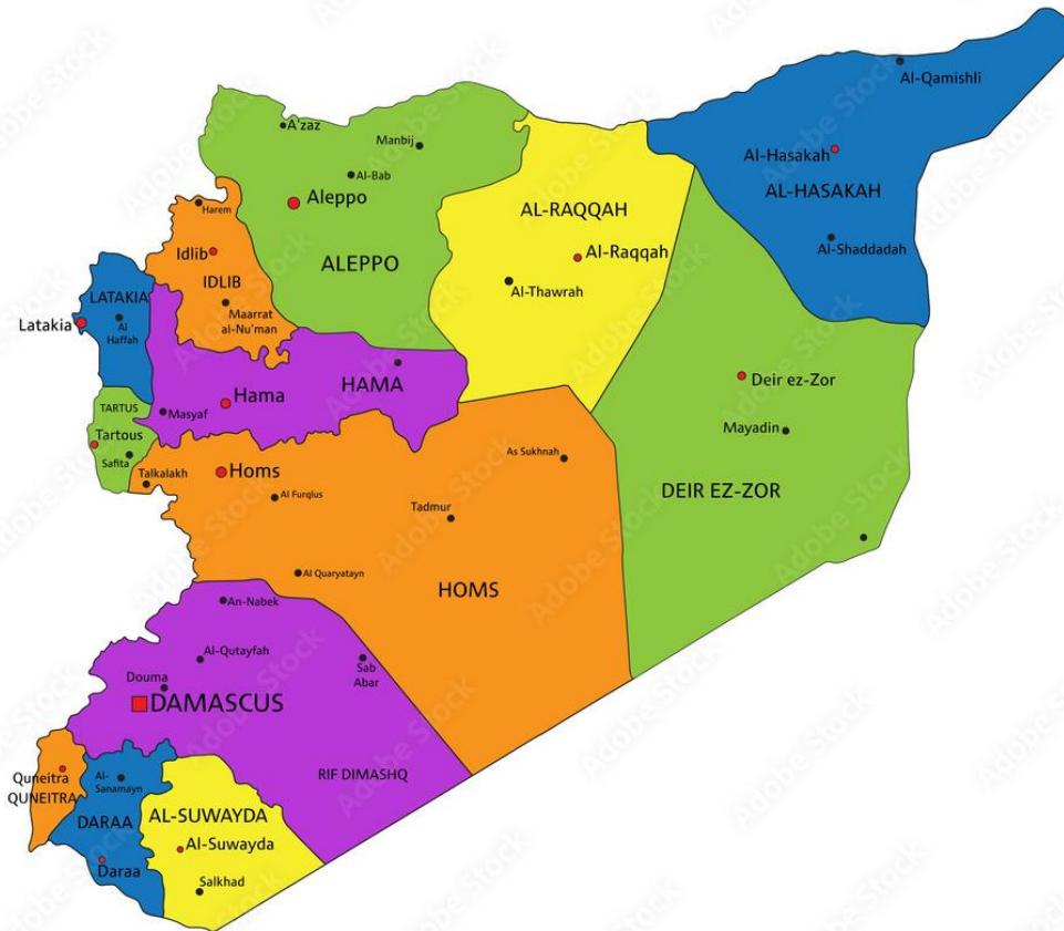
Map of Syria