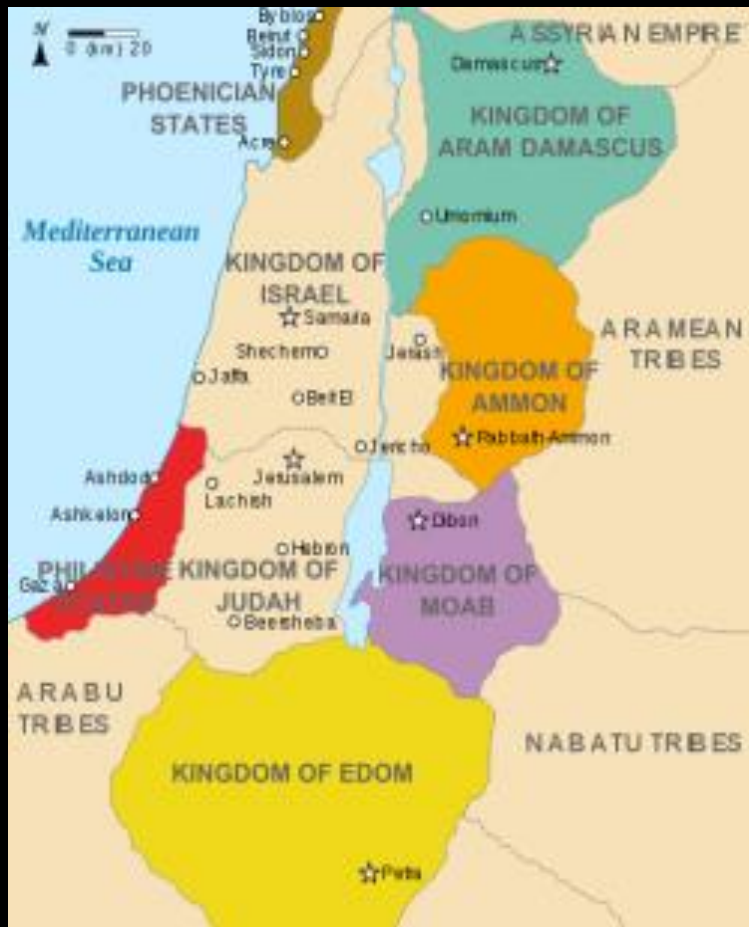
The Kingdoms of Ammon, Moab, and Edom ca. 830 BC.