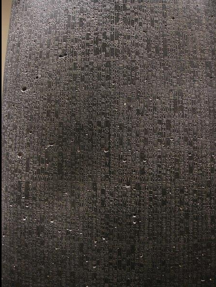
Photograph of the Hammurabi Stele Containing the Hammurabi Code; copyright: photo by Deror Avi; Stele Housed at the Louvre Museum, Paris, France