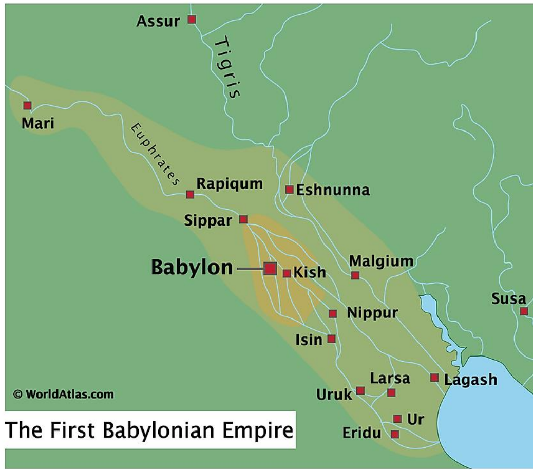
The Babylonian Empire Under Hammurabi; copyright: www.worldatlas.com