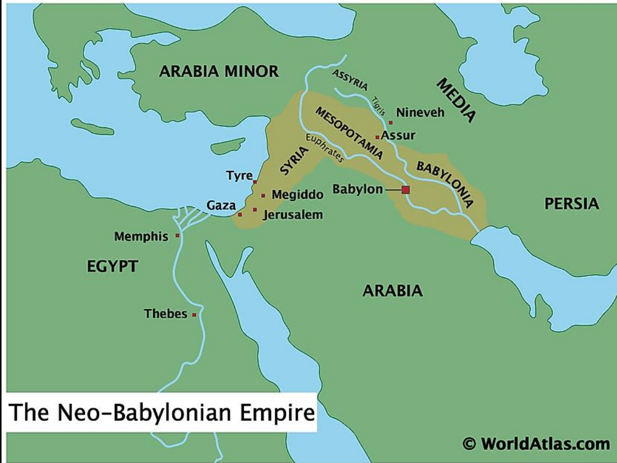
Map of the Babylonian Empire Under Nebuchadnezzar II