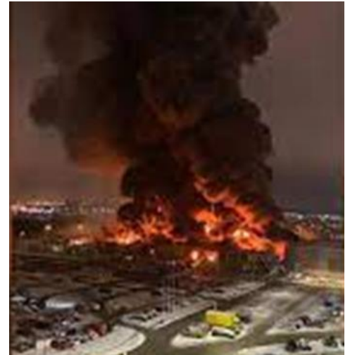
Moscow mall fire

US Army Special Ops Vet Jack Murphy claims US Intel and an unnamed NATO ally are running the sabotage missions that are targeting Russia. The Burning Platform reports that the NATO ally is Poland. The Russian news agency TASS reports: “Data from intercepted drones confirm the involvement of the US and Poland in preparation of terror attacks on the Russian territory.” Drones used in the attacks deep in Russian territory were analyzed. It was found that “the avionics and drone control stations were produced by US’ Spektreworks.” The assembly and flight trials were completed in Poland. Over the last few weeks, there have been several unexplained explosions within Russia itself. There have dozens of incidents including a massive fire at a shopping mall in Moscow and a gas pipeline 360 miles east of Moscow. Murphy: “CIA is behind spate of explosions in Russia.” 1 2