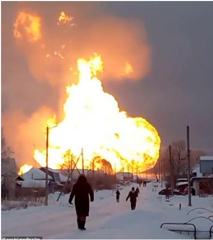
Pipeline explosion in Chuvashia