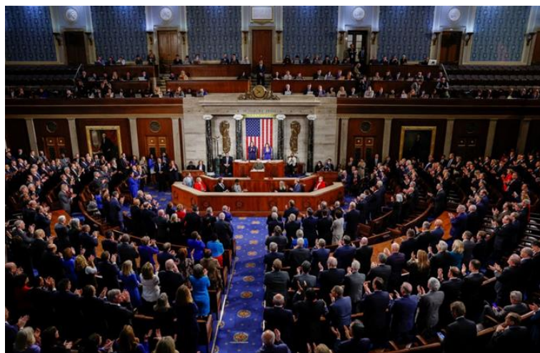
Zelensky address a fawning Congress....in a sweat shirt

There is a level of insanity going on – culturally yes – but especially in the highest levels that could see the