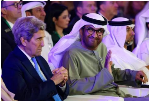
Kerry at the Atlantic Council Global Energy Forum in Abu Dhabi

So, the player was being called out for having an independent set of values developed despite pressures to conform, instead of buying into the corporate celebration being thrust on the league. [Of what value is ‘forced conformity, anyhow?'] This wasn’t the only controversy that should have never been. Hall of Fame Coach and current broadcaster Tony Dungy has long stood for Christian causes and has weathered a storm of criticism. Often called ‘homophobic’ for his past stands – a nonsense term bandied about by the Woke Left, Dungy attended this year’s March for Life suffering a torrent of criticism. Christianity is no longer tolerated among the Mainstream Media Mob. The New Culture – the New Truth is now required. All must now pledge allegiance to the New Woke Creed!