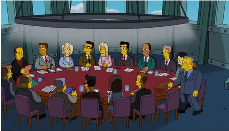
The Simpsons “The Fool Monty” November 21, 2010

PASS DOWN THE GENETIC CODE FROM PARENT TO CHILD. ” This came from a researcher paper published by Lund University.] This IS reality now!] Link to the paper here.