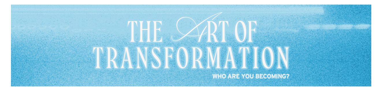
Part 3: Effective and Productive