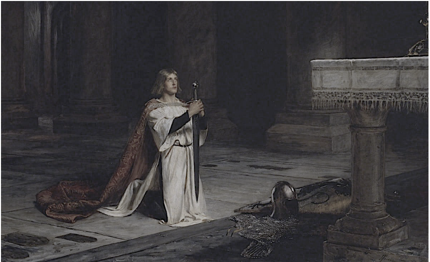
The Vigil (1839–1893)