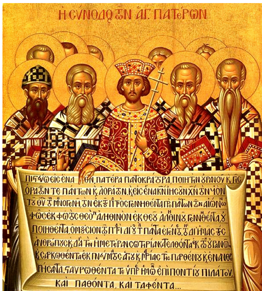
The First Ecumenical Council: The Nicene Creed, Constantine the Great & the Holy Fathers