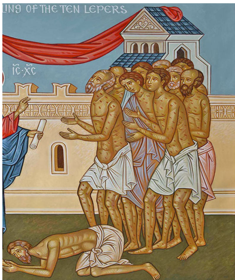
"The Healing of the Ten Lepers"