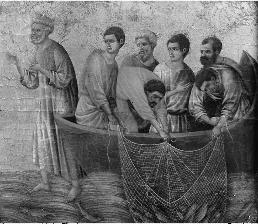
Appearance at Lake Tiberias century)