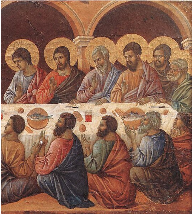
“Appearance While the Apostles are at Table”