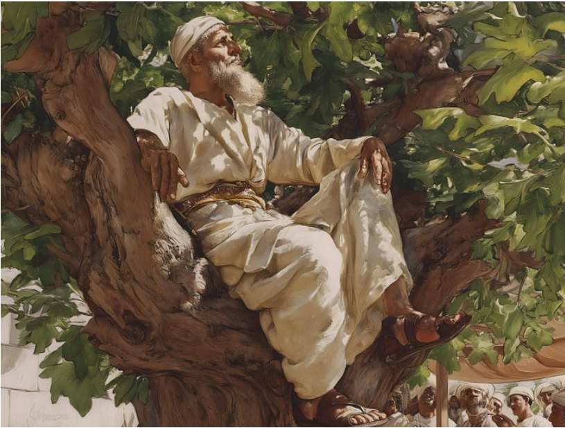
“Zacchaeus in the Sycamore Tree”