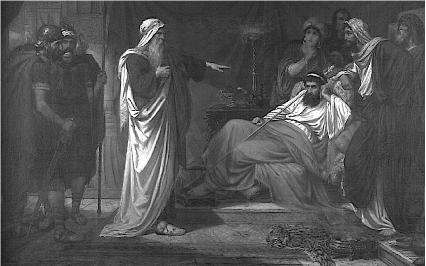
The Prophet Nathan Rebukes King David (1866–1931)