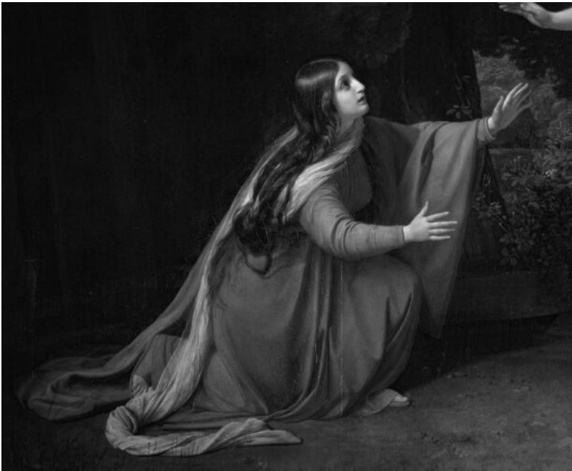
Mary Magdalene After the Resurrection (1835)