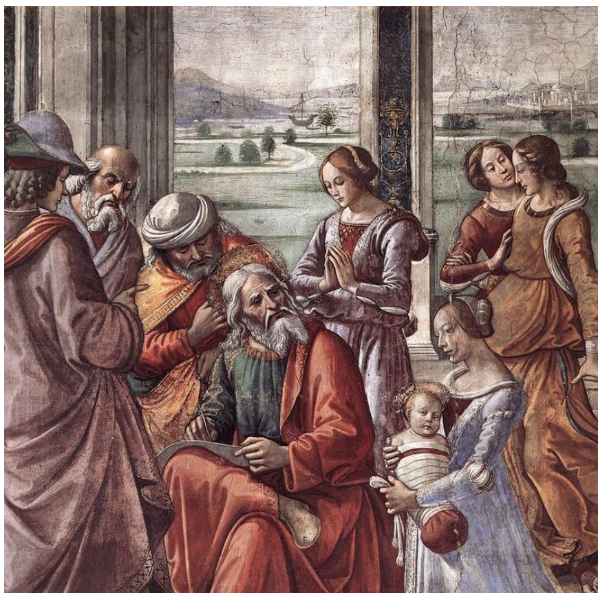
Zechariah at the Birth of John (Domenico Ghirlandaio, 15 th cent)