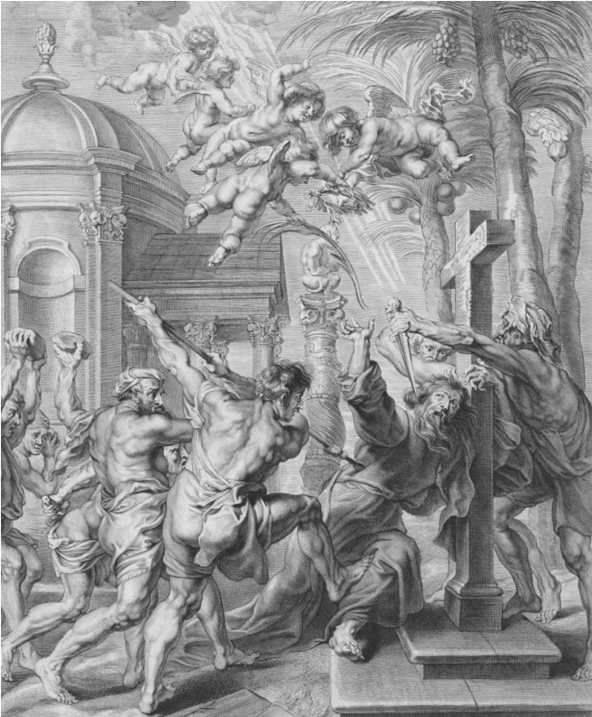
The Martyrdom of St. Thomas