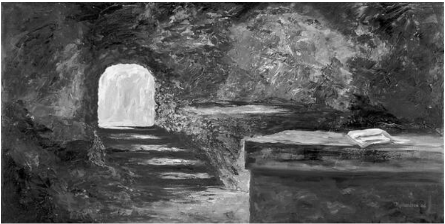
The Empty Tomb