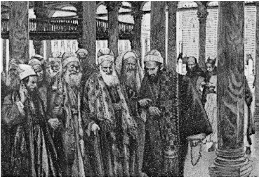
The Pharisees & Sadducees Tempt Jesus