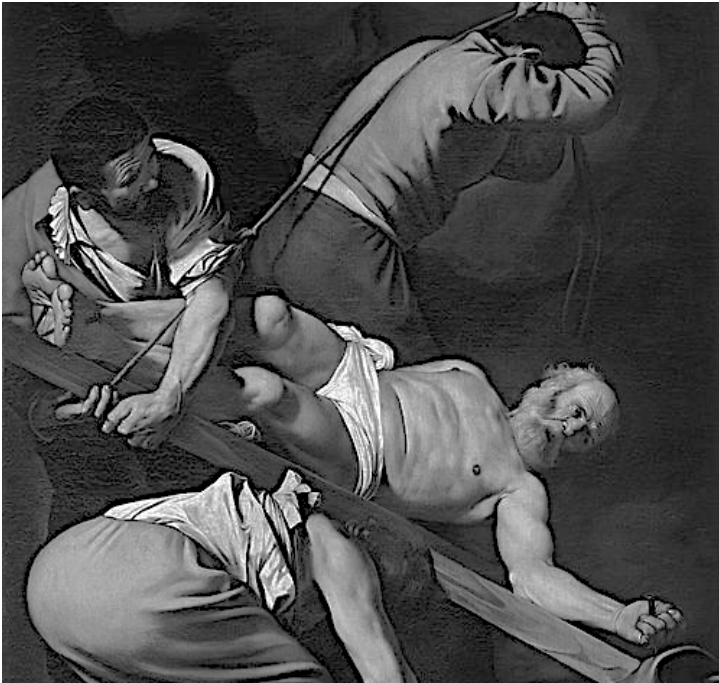
Martyrdom of St. Peter