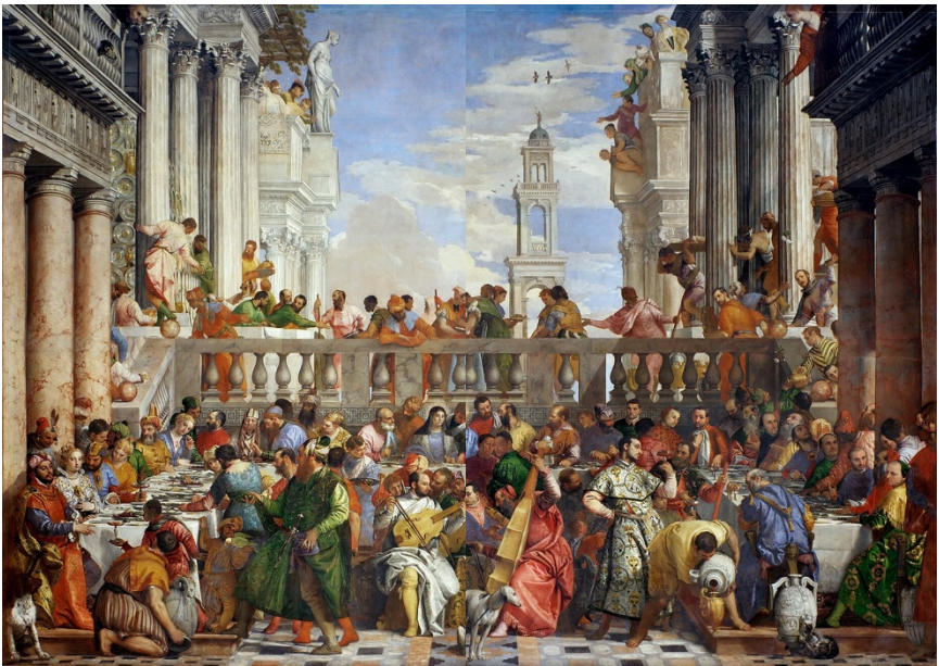
“The Wedding Feast at Cana”