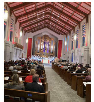
Christ Church Cathedral Connections 2024 Parish photo directory

Once we have verified and made all desired edits, we will send a final version of the digital version and print out physical directories to mail in the next couple of weeks to all that opted in!