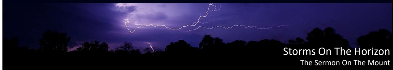
Storms On The Horizon The Sermon On The Mount