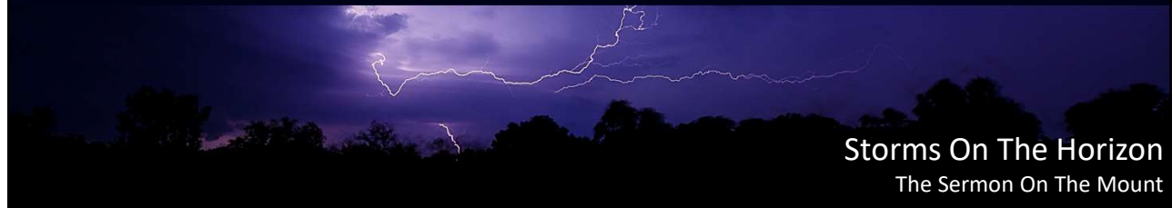
Storms On The Horizon The Sermon On The Mount

"Therefore do not be anxious about tomorrow, for tomorrow will be anxious for itself. Sufficient for the day is its own trouble.