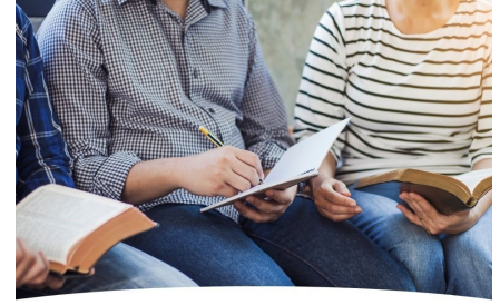
Priscilla Circle WOMEN'S GROUP AT FPCE