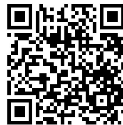
Pastor's QR Code