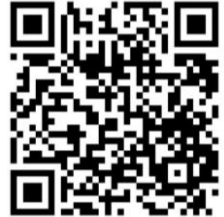
Pastor's QR Code