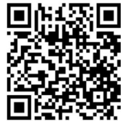
Pastor's QR Code