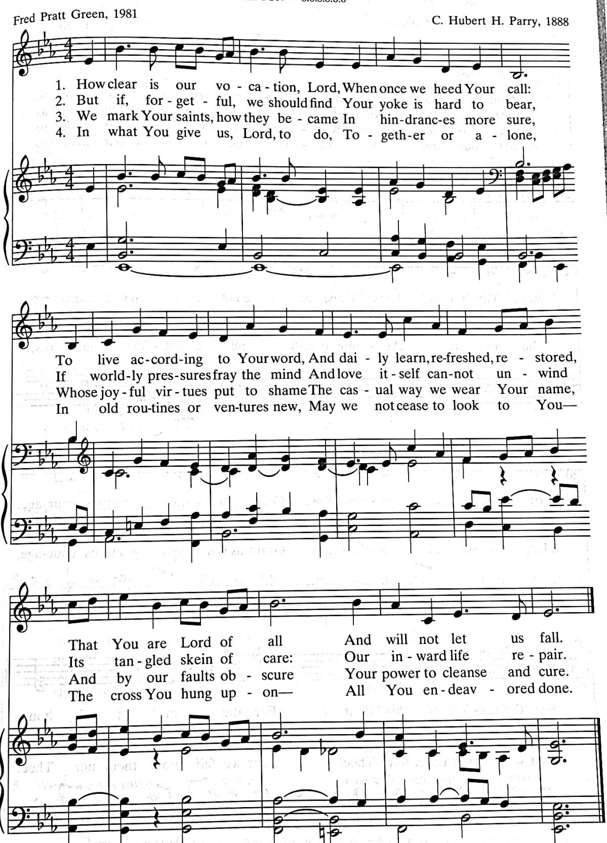
Text: Copyright © 1982 by Hope Publishing Company, Carol Stream, IL 60188. All rights reserved. Used by permission,