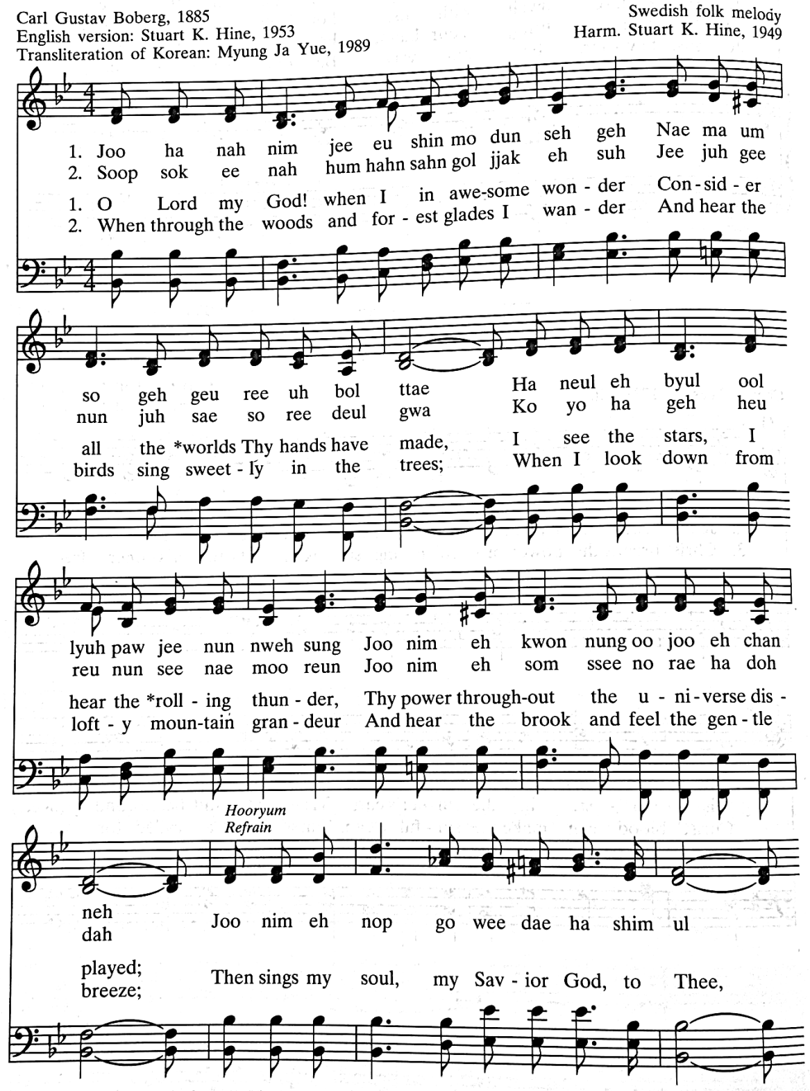
Text and Music: © 1953 by Stuart K. Hine. Assigned to Manna Music, Inc. © 1955, renewed 1981 by Manna Music, Inc. International copyright secured. All rights reserved. Used by permission. Transliteration © 1990 Westminster/John Knox Press. All rights reserved.