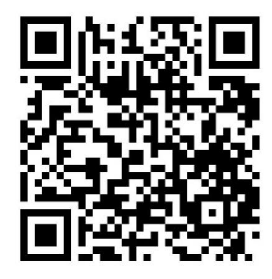
Pastor's QR Code

On Sundays, we are blessed to have wonderful people guide us in worship through the leading of the call to worship, prayer of confession, and other parts of our service. If you'd like to be