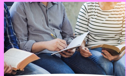
Priscilla Circle WOMEN'S GROUP AT FPCE