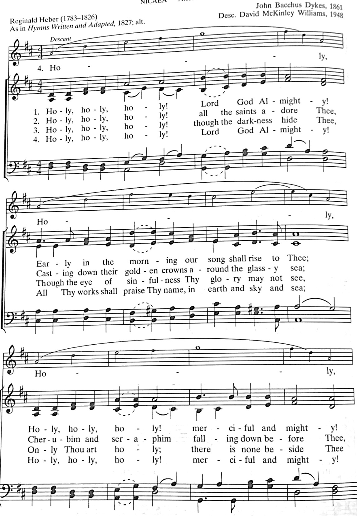
Music: Descant © 1948 H. W. Gray Co., Inc. Copyright renewed H. W. Gray Co., Inc., a division of Belwin-Mills Publishing Corp. All rights reserved. Used by permission.