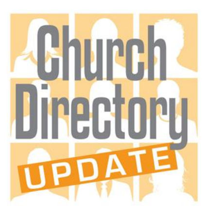
image resolution is as high as possible, since we may need to crop or enlarge your photo to fit the space available. Here are a few ways you can create a photo for the directory:

The Deacons would like to put together a new photo directory of FPCE members/friends. Rather than having photos taken by a professional photographer, we thought that it would be more interesting to have members/friends submit their own photos. These photos could be informal and bring out the personalities of members/friends. For example, a photo might include a pet, a child or grandchild, a favorite vacation spot, or a favorite hobby. We would like to produce the directory sometime this fall. Whatever photo you decide on, be sure that your face fills enough of the frame so that you are recognizable. And be sure that the