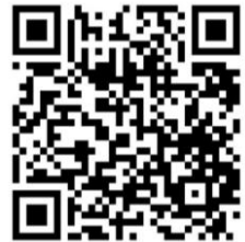
Pastor's QR Code