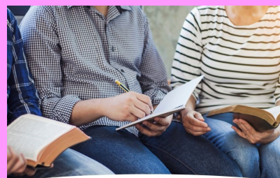
Priscilla Circle WOMEN'S GROUP AT FPCE

Priscilla Circle will resume meeting on Monday, September 11th, at 11:30am in Calvin Lounge. This year, our study will be about Luke. Attendees may bring a lunch if desired. Coffee and dessert will be provided. All women are welcome.