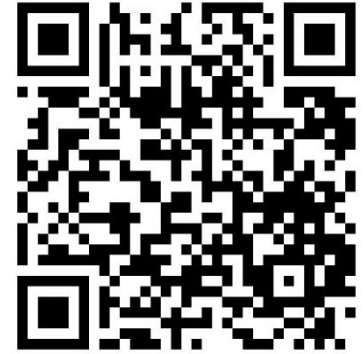
Pastor's QR Code