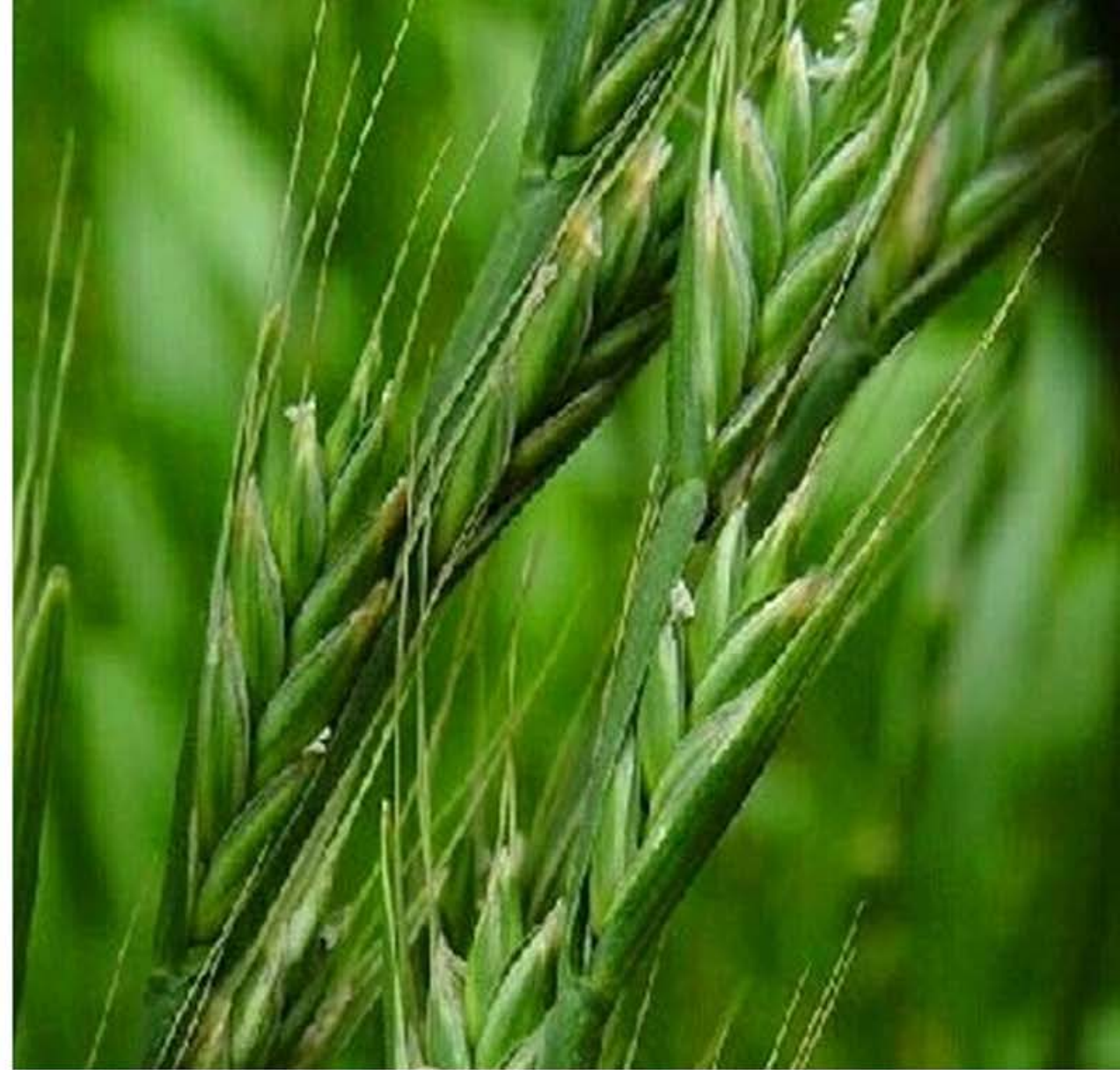
TARES: Lolium temulentum