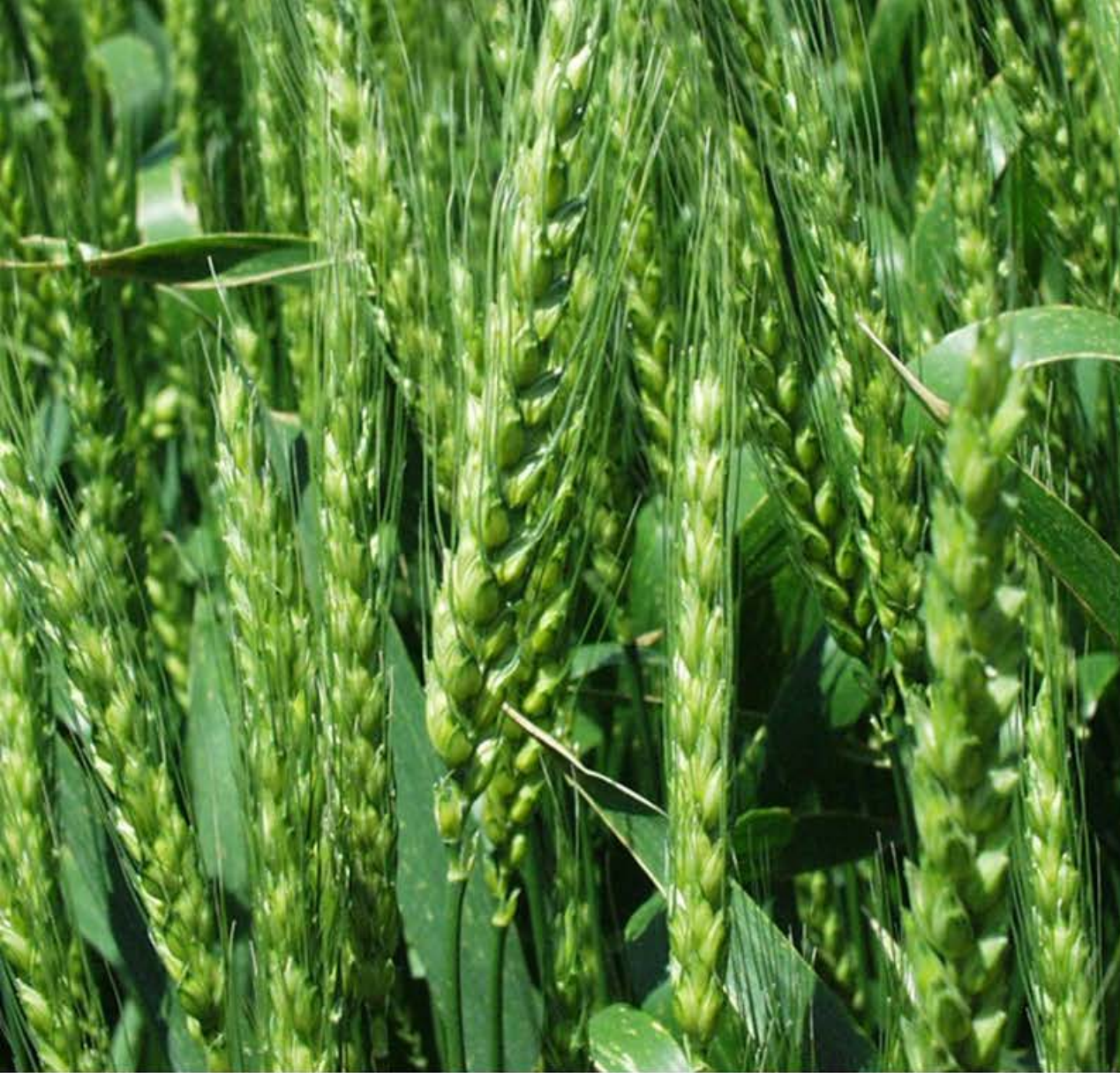
WHEAT: before it is fully ripe.