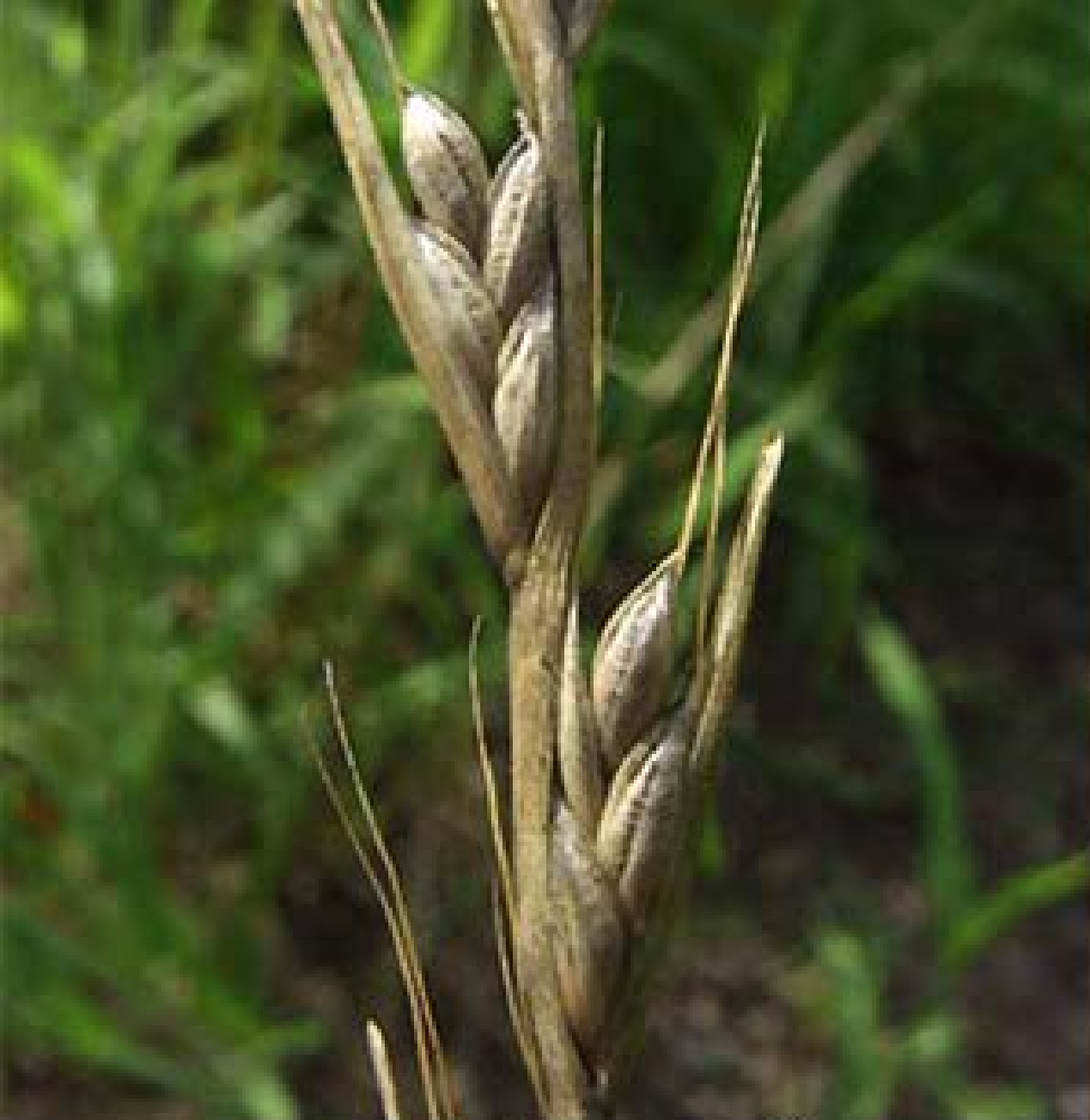
Tares - Darnell