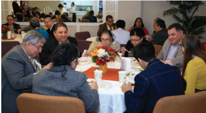
Department of Social Assistance was able to provide over 1,600 free meals to over 250 pastors and their families

when we are many, we have the responsibility to feed His sheep in any situation that arises. This demonstrates our faith in the power He has given us. Not only did Jesus feed over 5,000 hungry people until they were satisfied, BUT he divided them up into groups of 50's and 100's (not by ranks or position) to show us the importance of breaking bread together and having meaningful conversations as equals.